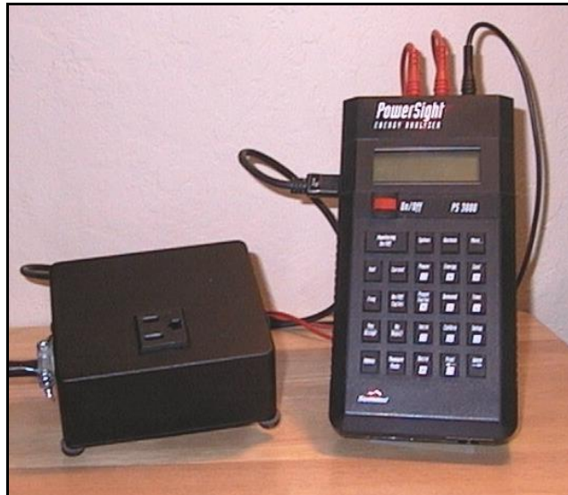
PowerSight® connects easily to the 120ADP

Voice: 1-925-944-1212 Fax: 1-925-521-1220 Email: sales@powersight.com